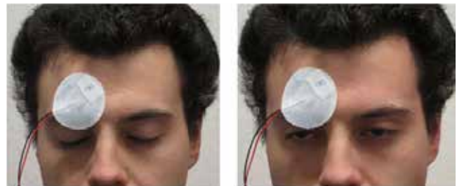
Figure 2. Effect of the instruction «corrugate» in pre-hypnotic basal conditions and in hypnotic flaccid paralysis in subjects No. 8.

The hypnotic flaccid paralysis is shown in Figure 2, where the smoothing of the corrugator with impossibility to corrugate when the hypnotic command was operative is shown.